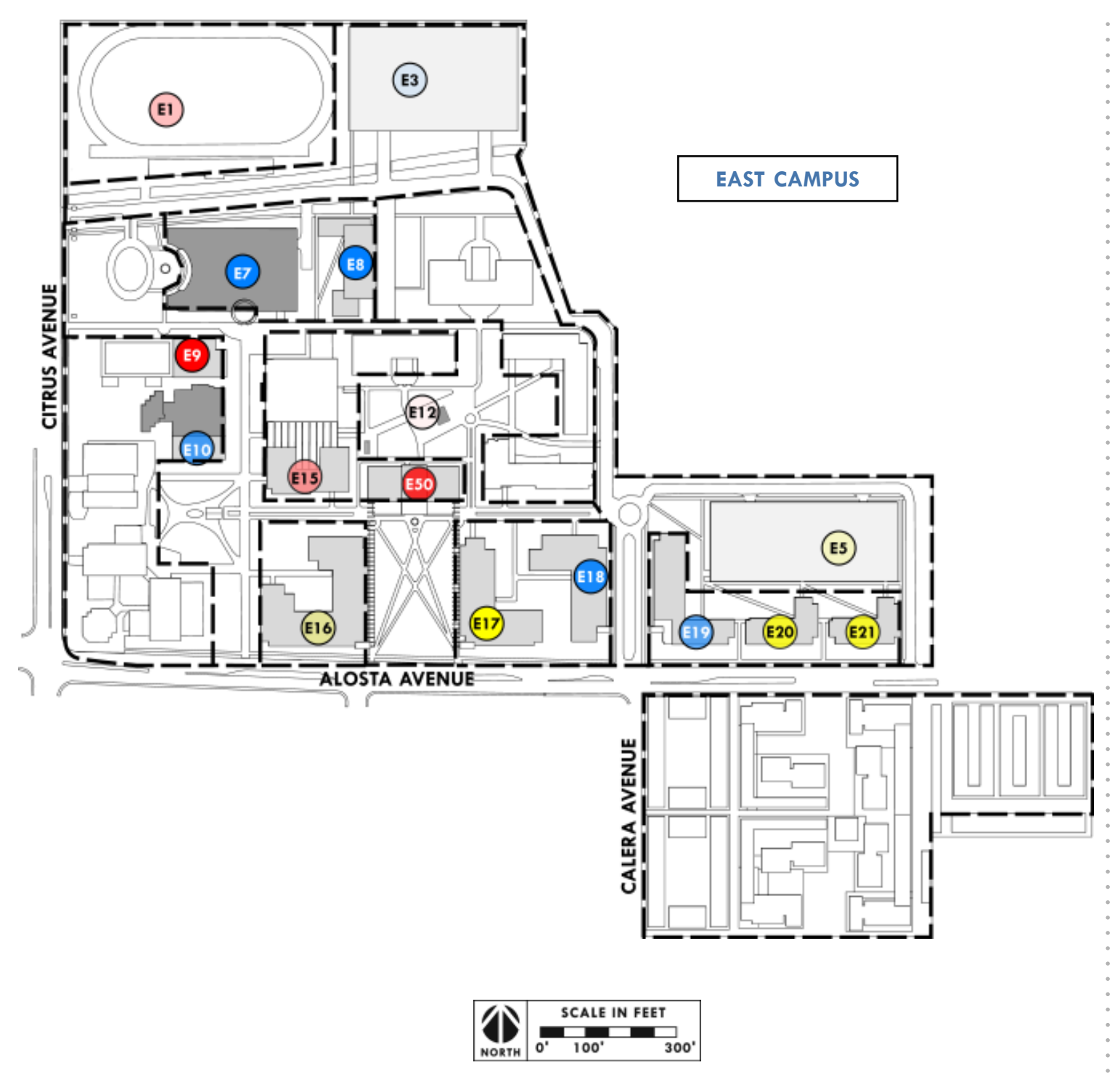
EXHIBIT 7B LOCATION OF PROPOSED DEVELOPMENT—EAST CAMPUS

Such mitigation measures must be taken to the extent necessary to bring the number of required parking places (based on the approved demand ratio) to less than 95 percent of the actual parking places (including any parking spaces provided through such mitigation measures).