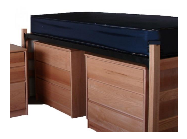
Captain's height bed with dressers pictured underneath. Each students receives one dresser. Some students may decide to put both roommates' dressers under one bed to maximize space in the room.