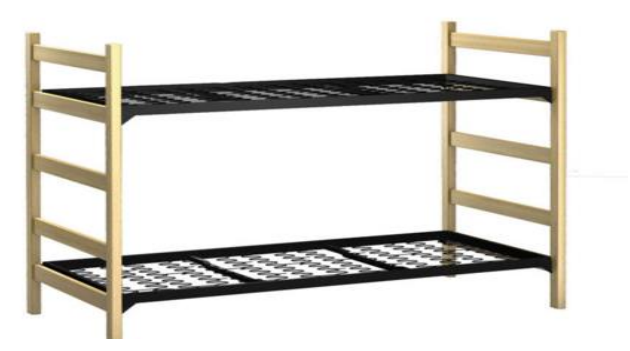
Bunk bed pictured without mattresses. Students on top bunk climb up ladder style bed end.