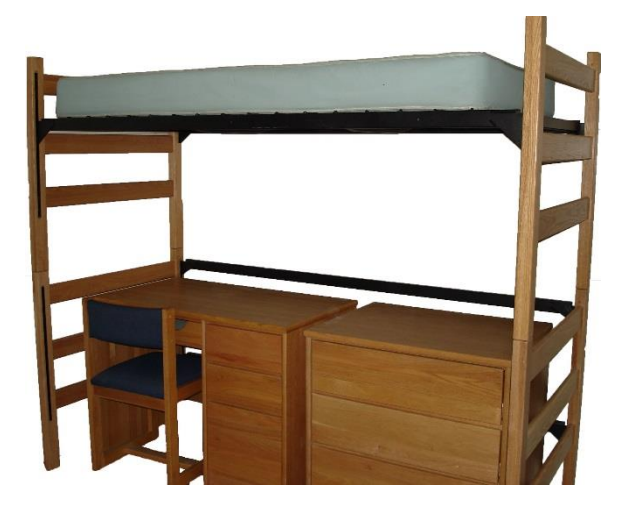
Lofted bed with desk and dresser pictured underneath. One loft kit is currently provided in oversubscribed (tripled) rooms only.