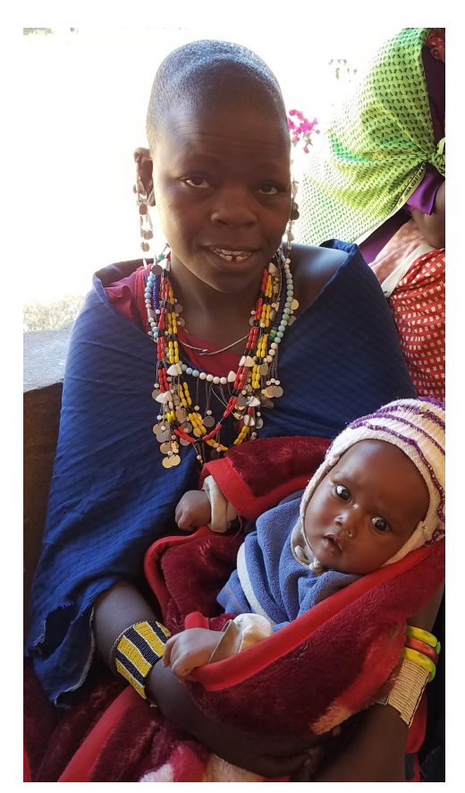
Pictured: Young Tanzanian Mom and her child

The post-natal period is the only time a women is pampered in the Maasai culture. The mother is to stay indoors for 3 months and be given good food in a special bowl and rest. A goat is slaughtered for her to eat. We saw some very happy new mothers enjoying their time of relaxation! The normal schedule for a woman is to walk long distances to gather water, build the homes of mud and sticks then seal with cow dung, cook the little