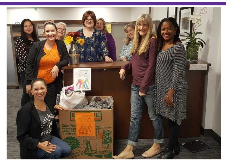
Above show photo of San Diego Regional Center Founder's Day Action Acitivity benefitting San Diego Rescue Mission