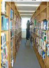
I'm a librarian